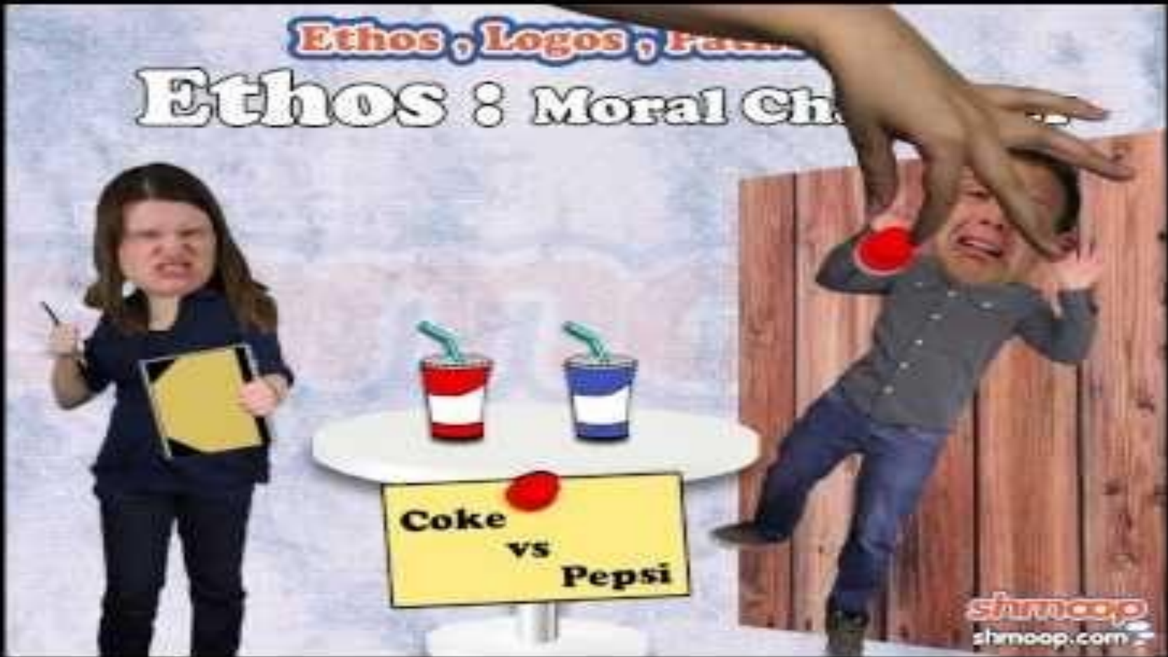
Ethos, Pathos, Logos